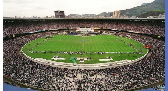
The original Maracanã stadium configuration, before the renewing works.