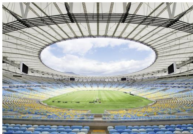
New lightweight roof for Maracanã Stadium(1)

Go behind the scenes of Maracanã Stadium, stage of the 2014 World Cup Final Game. From the Tribune Press to the locker rooms, through the Grandstand, the cabins and a collection of relics of the stars who made the history of the world soccer temple. Prepare yourself for a world of dreams, exploring every way, with videos, sounds and different experiences that will last forever in your memory.